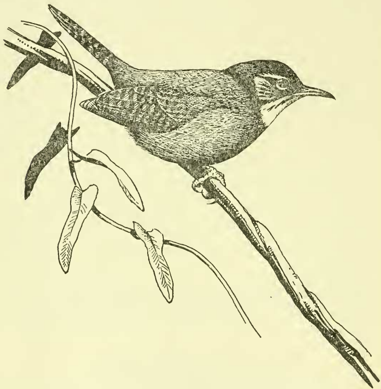
FIG. 2.—Bay wren, Cucarachero Castaño Cabecinegro.

One pair worked busily at a nearly completed nest located near the tip of a leafy branch about 6 feet from the ground in heavy undergrowth. This was a ball, nearly round, of palm and other slender